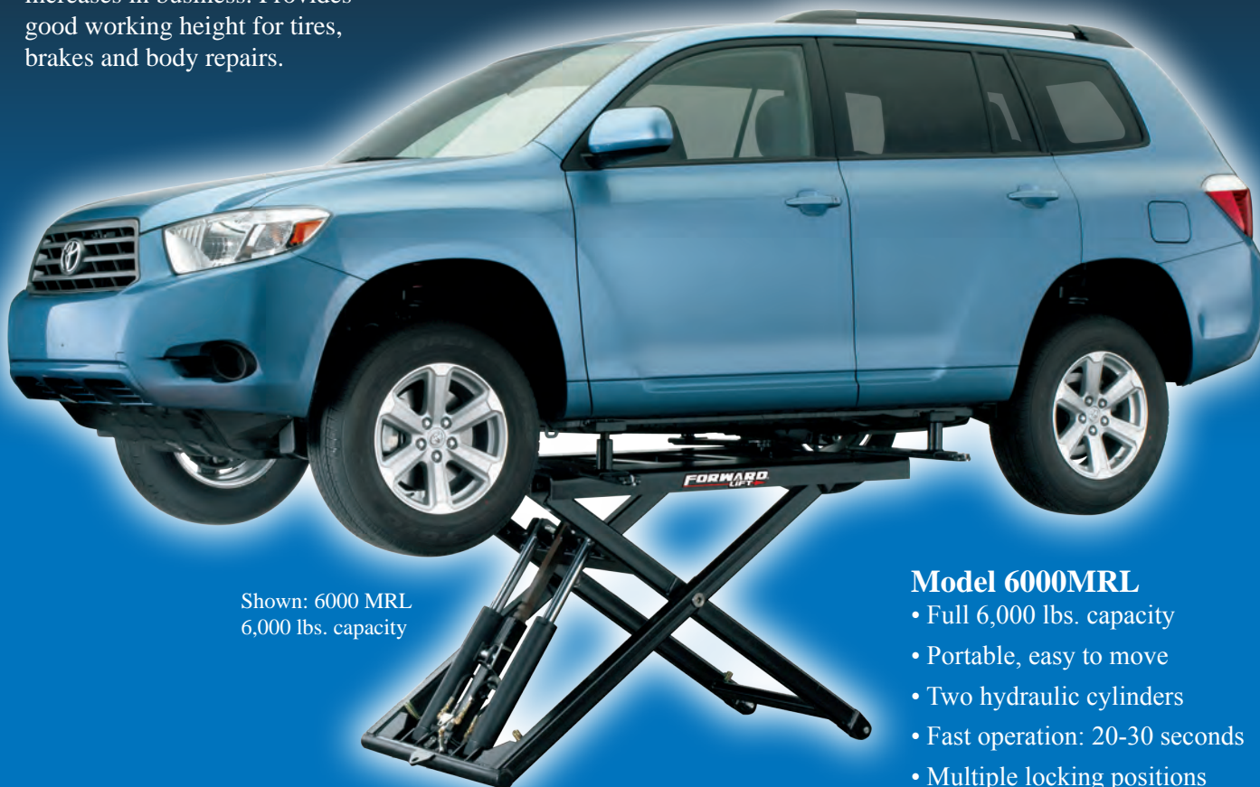
Shown: 6000 MRL 6,000 lbs. capacity

The mid-rise lift is an excellent choice for low ceilings or adding a bay for seasonal increases in business. Provides good working height for tires, brakes and body repairs.