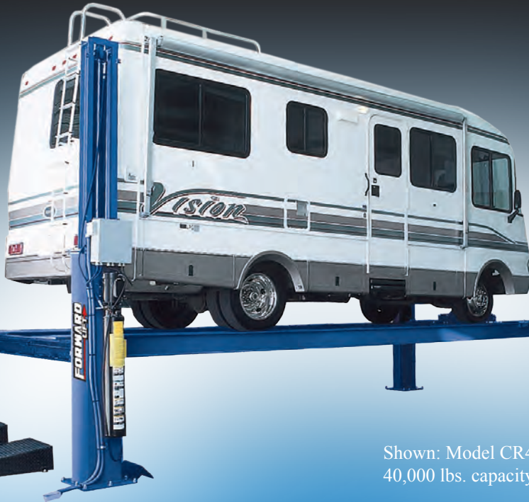
Shown: Model CR40 40,000 lbs. capacity