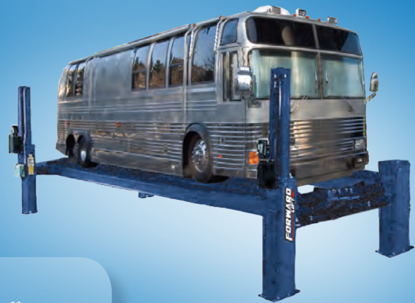
Shown: Model CR60 60,000 lbs. capacity